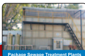
Package Sewage Treatment Plants

283, Kasba Peth, A-8 Yashodatta Society, Pune - 411011, Maharashtra, India Cell : +91 94218 53381 | 93702 85444 E-mail : avcompany2014@gmail.com sales@avcoglobal.com Website : www.avcoglobal.com