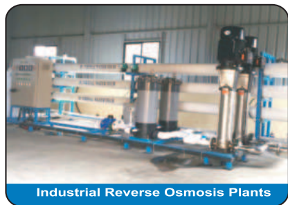
Industrial Reverse Osmosis Plants