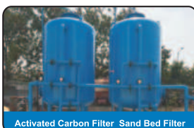
Activated Carbon Filter Sand Bed Filter