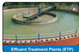
Effluent Treatment Plants (ETP)